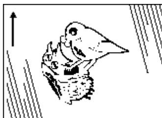
Mirror Print is selected Mirror Screens with Output is selected

Note: If Round is selected in the Dot Shape list, the Rotate Screens With Pages and Mirror Screens With Output selections don't affect output.