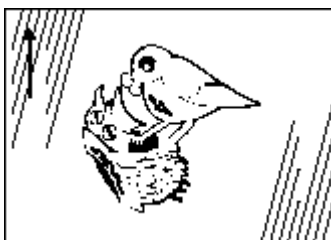
Mirror Print is selected Mirror Screens with Output is cleared

When the Mirror Screens with Output check box is selected, selecting the Mirror Print check box in the Device section of the process template causes screen angles to become mirrored with the output. This is useful for some printing processes that require mirrored film or plates, to ensure consistency of screen angles with digital dot proofs.